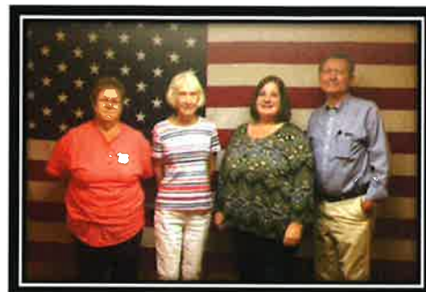
Marshall County Team "The Marshalls"