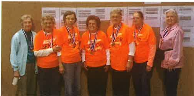
Women's Shuffleboard Winners