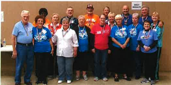
Mixed Doubles Shuffleboard Winners