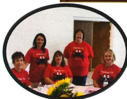
AAAD & MyRide Staff working at the Public Forum Kickoff Event Oct. 5 th at First United Methodist Church in Lawrenceburg