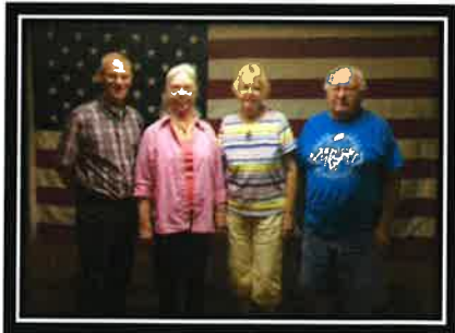
Giles County Team "The Forever Young"