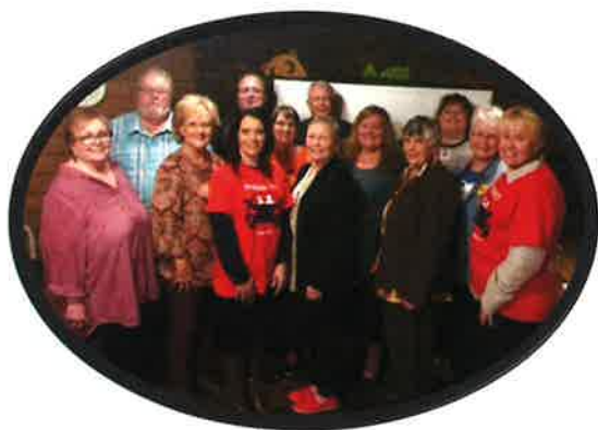
First MyRide Lawrence Volunteer Driver Training held October 26 th at David Crockett State Park