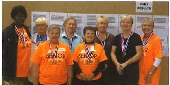
Women's Shuffleboard Winners

Many of the SCTDD staff volunteered for the Tennessee Senior Olympics for the South Central District during the week of October 22 nd . Each year, the SCTDD and AAAD helps to sponsor and support the Senior Olympics through our partnership with the Lawrenceburg Parks & Recreation. Thanks to all who volunteered to make the event a success! And, congratulations to all of the senior competitors!