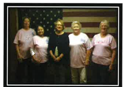
Lincoln County Team "Sassy Seniors"