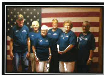
Franklin County Team "The Smarties"