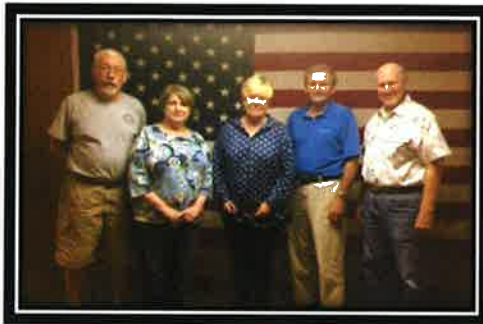
Lawrence County Team "Aged to Perfection"