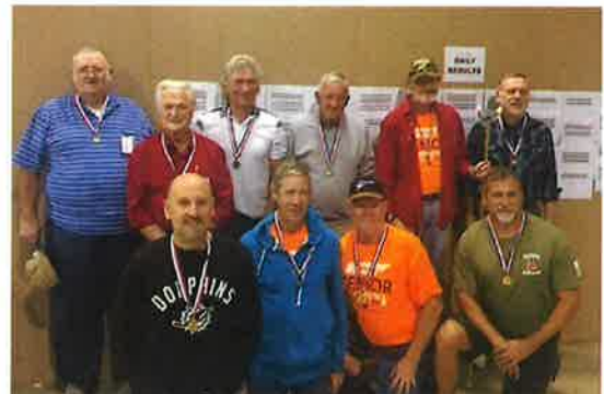
Men's Shuffleboard Winners