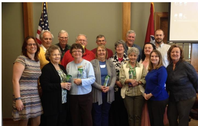
SHIP Volunteers given Tokens of Appreciation by SHIP Staff at the Quarterly SHIP Volunteer Training Session