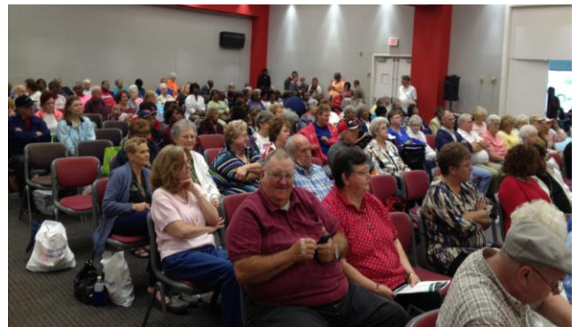
Seniors Enjoying the Entertainment

The 15 th Annual Senior Expo was held May 18, 2016 at the Northfield Conference Center in Spring Hill. Over 300 seniors age 50 and older registered and received a free Chick-Fil-A box lunch, and had the opportunity to visit over 45 exhibit booths, get free health screenings, attend educational sessions, enjoy live entertainment, and door prizes. The Senior Expo is a coordinated effort among members of the Maury County Health Council and the South Central TN AAAD.