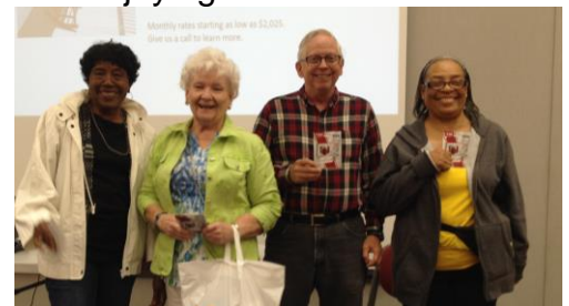
4 of the 5 Winners of $100 Gift Cards