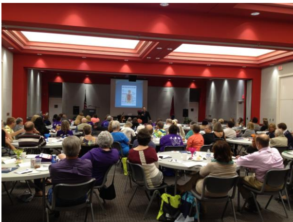
2016 Adult Abuse Coalition Conference